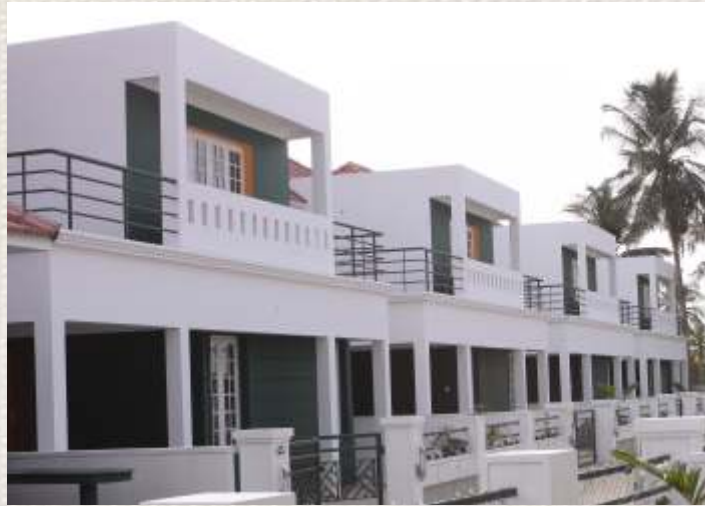
Kent Hydepark, Tripunithura