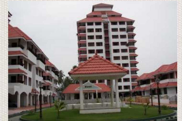
Kent Gopuram, Near E.M.C