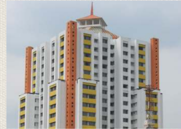
Kent Glass House, Vyttila