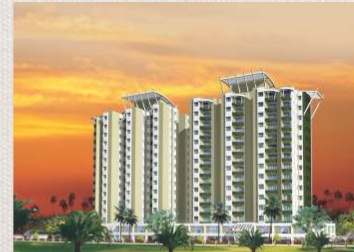
Kent Palm Grove, Kaloor