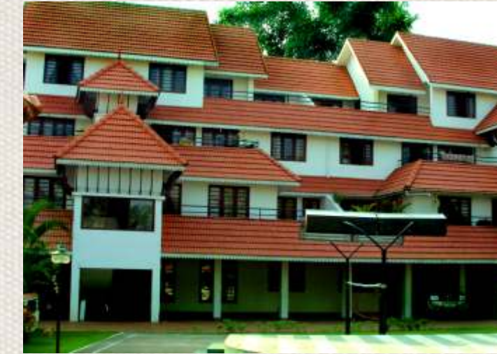
Kent Nalukettu Apartments