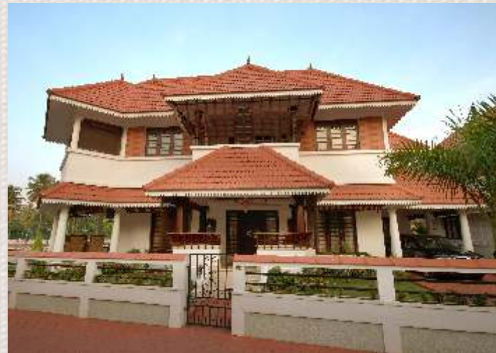
Kent Nalukettu, NH Bypass