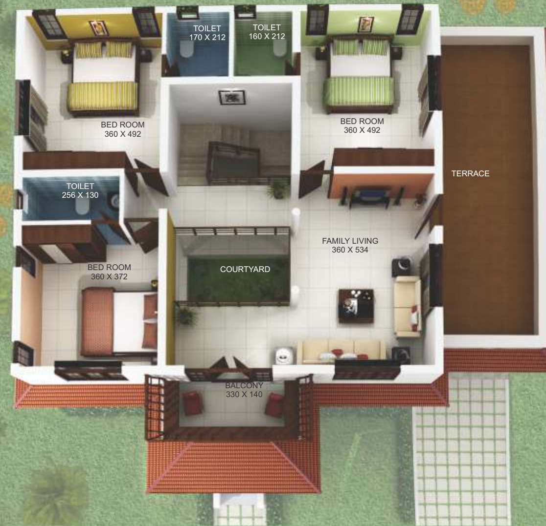
TYPE - A FIRST FLOOR - 1306 sq. ft TOTAL AREA - 3086 sq. ft