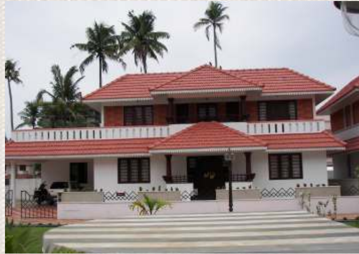
Kent Illam, Near E.M.C