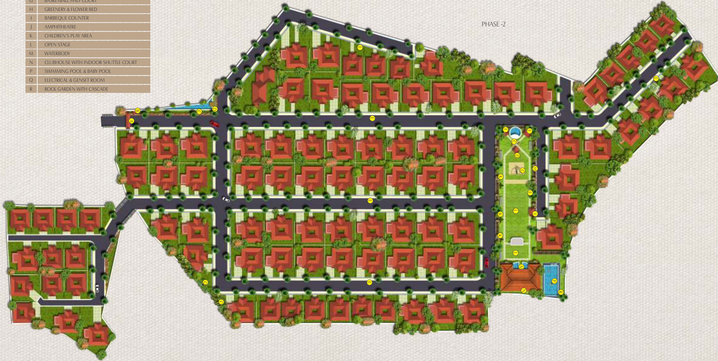
Site Layout Plan