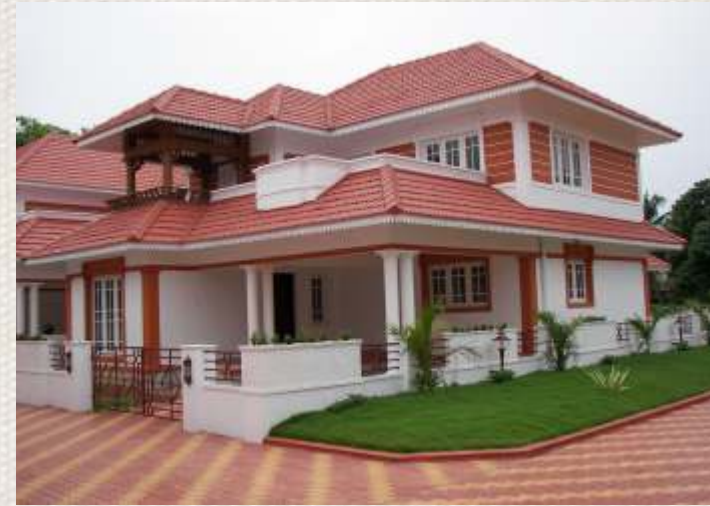
Kent Kovilakam, NH Bypass