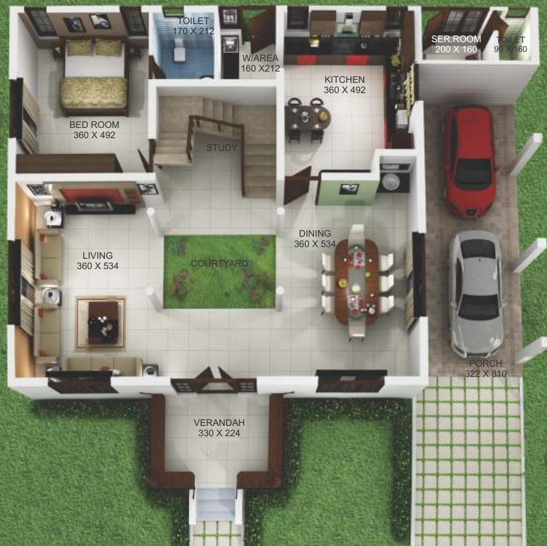
TYPE - A GROUND FLOOR - 1780 sq. ft TOTAL AREA - 3086 sq. ft