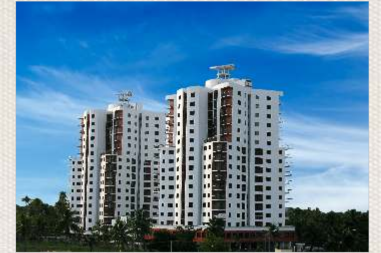
Kent Hail Garden, Kaloor