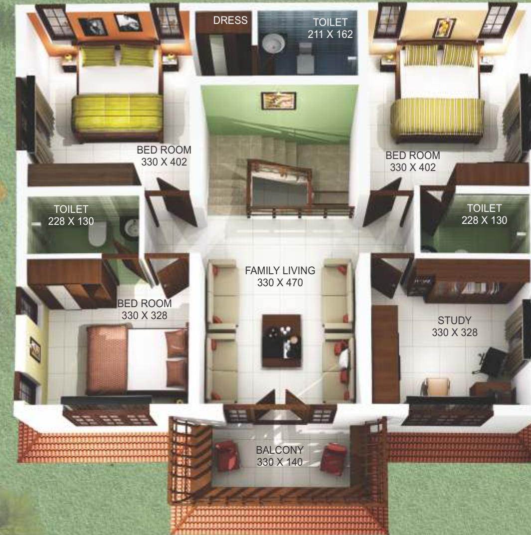
TYPE - B FIRST FLOOR - 1138 sq. ft TOTAL AREA - 2294 sq. ft