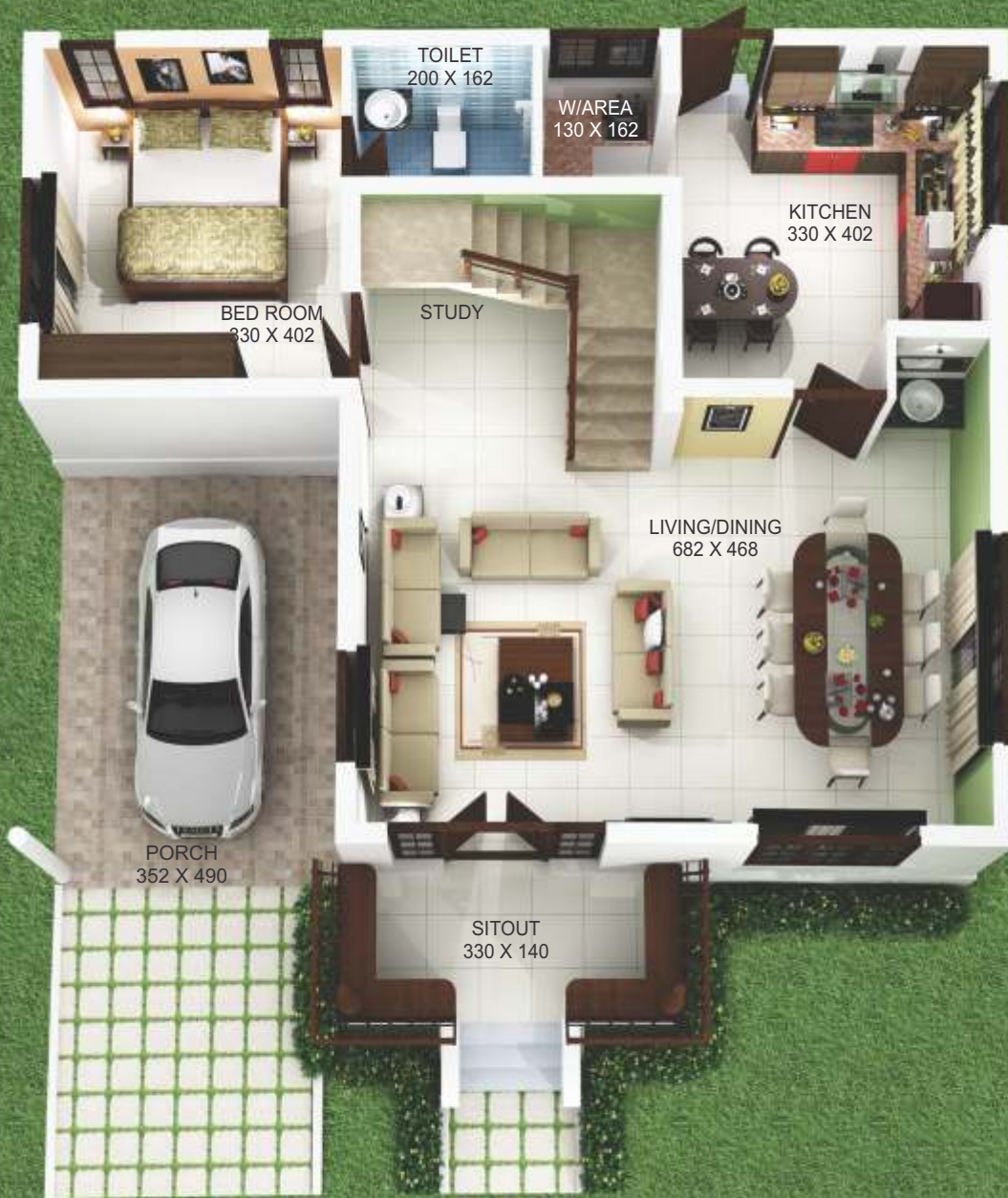
TYPE - B GROUND FLOOR - 1156 sq. ft TOTAL AREA - 2294 sq. ft